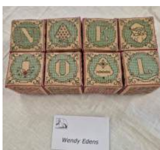
From a WAW class