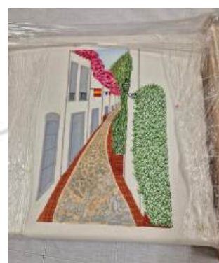
This stunning picture has been embroidered by Esmee, a student from the Victory Embroiders.