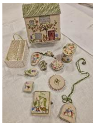
Well done Rosemary - it was a while in the making, but the result was worth waiting for.