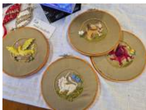
The photo doesn't do justice to Paula's mythical creatures.