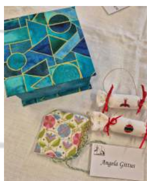
Angela's coif needlecase is intriguing.