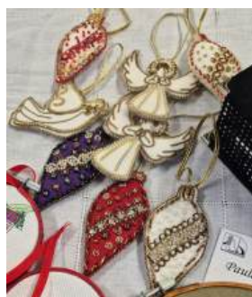
Paula's needle must have been red hot by the time she finished all this lovely work.