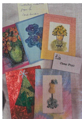
Cards made by Dana, using a Cuttlebug embossing machine