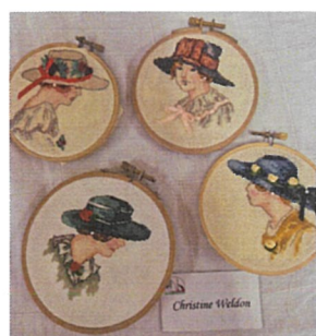
Christine's beautiful work, the kits are from the Fox Collection.