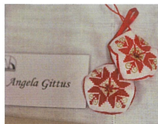
Beautiful decorations from Angela.