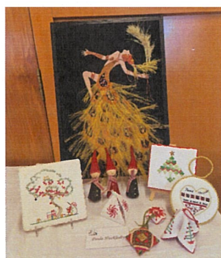
Paula has been busy!