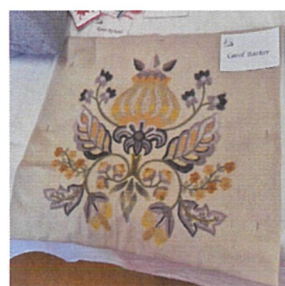
The photo doesn't do justice to the lovely colours in Carol's crewel work cushion.