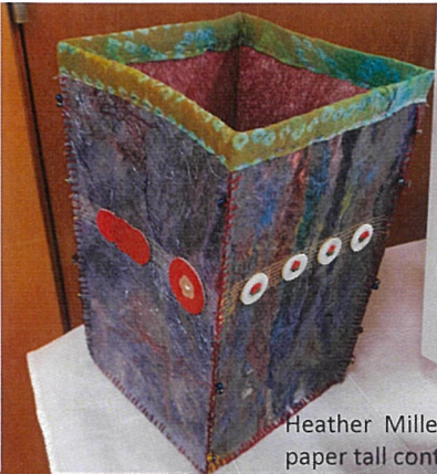
Heather Miller : Silk paper tall container