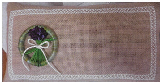
Carol Barker : Stumpwork nametag : Stumpwork Hydrangeas (from Inspirations pattern : small stitched bag.