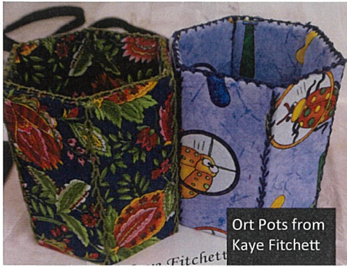
Ort Pots from Kaye Fitchett