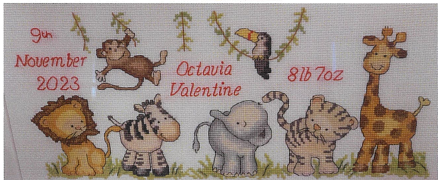
Betty Wells: Surface work sampler