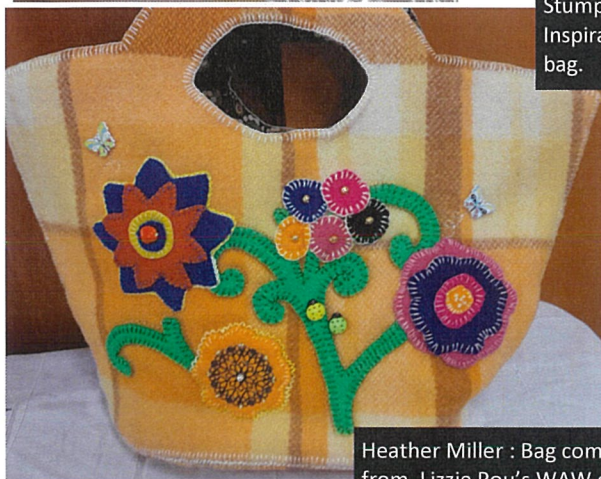
Heather Miller : Bag completed from Lizzie Pou's WAW class.