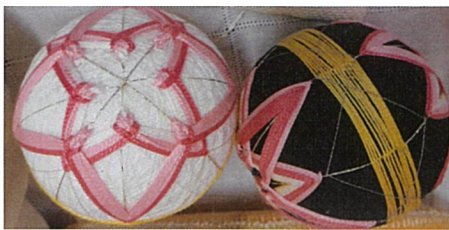
↑ Peggy Balck : Tamari balls : Assisi work flowers →