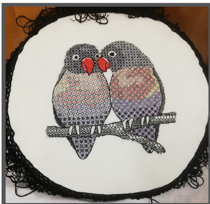
Nadia, Blackwork Parrots