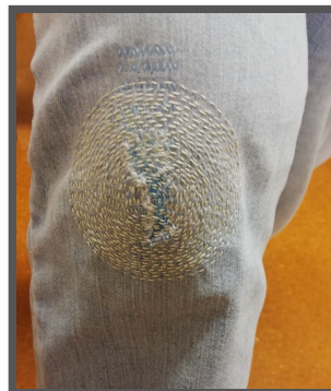
Annette's boro knee patch