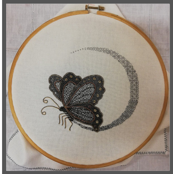
Carol, Spectral Butterfly, Snowflake and Persian Tile