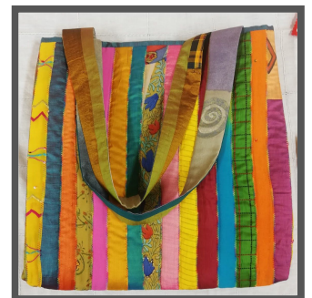
Heather, Sari silk, book cover and bag