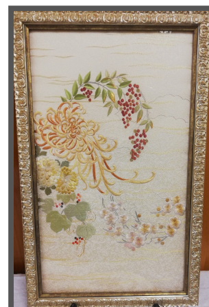
Justy, Chinese Embroidery