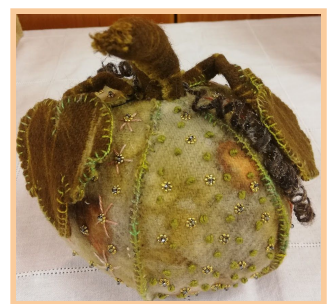
Cheryl Curtis, eco dyed pumpkin