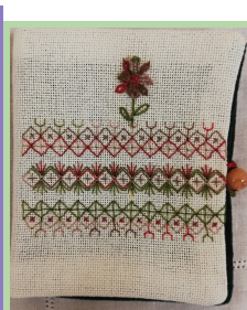
Paula Hucklesby, canvas tile, Christmas trees, wessex needlecase