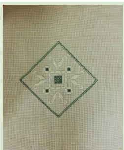
Shannon Page Moreton hardanger pieces